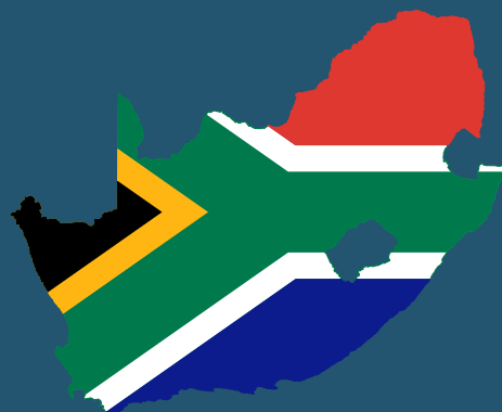
One of our smoke ventilator installations Cape Town